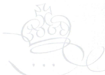
Royal Mail First Day Cover